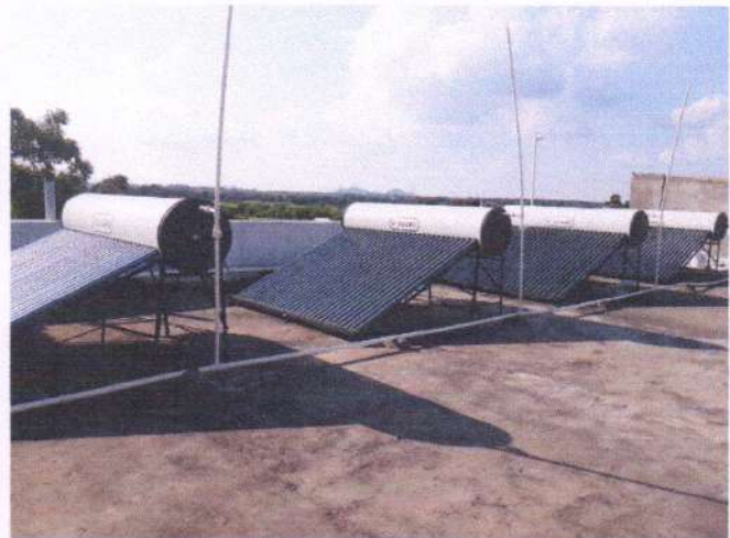
Solar Energy Panels