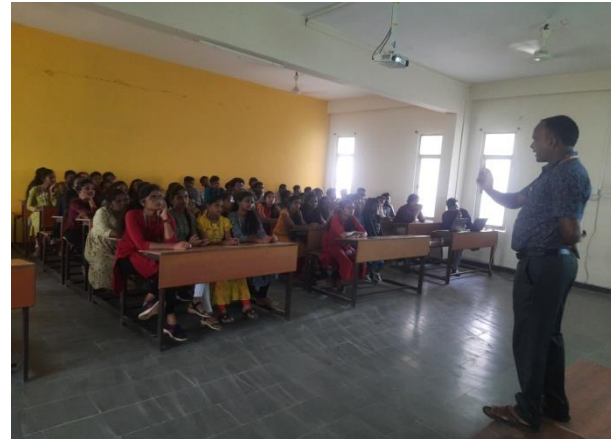
Sexual Harassment Counselling