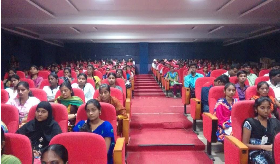
Gender Sensitization Counselling

Approved by AICTE, PCI-New Delhi & Affiliated to JNTUH P.O.BOLLIKUNTA, WARANGAL-506 005 (TELANGANA STATE)