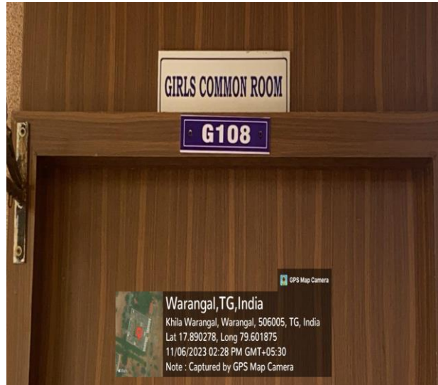
Girls Common Rooms