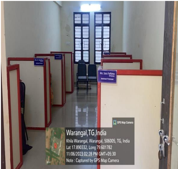
Women Staff Room

Approved by AICTE, PCI-New Delhi & Affiliated to JNTUH P.O.BOLLIKUNTA, WARANGAL-506 005 (TELANGANA STATE)